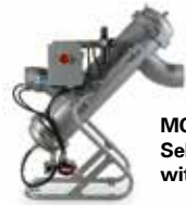
MCS Automatic Self-cleaning Strainer with Magnetic Coupling