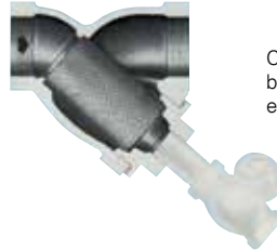
Cross-section of a Y Strainer with blow off connection for quick and easy clean-out.