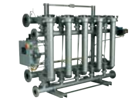
F-Series Tubular Backwash Filter in Multiplex Configuration