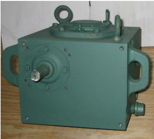
70 Series Gearbox exchange returned to client