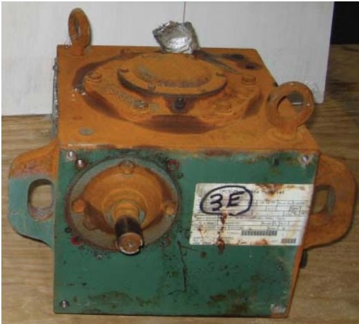
70 Series Gearbox returned to SPX

SPX FLOW Lightnin is the only supplier of original equipment for Gearbox Exchange Services for industrial mixers and agitators. Exchange services allow the customer to get a direct replacement gearbox for a fraction of the cost of a new one. Lightnin's 48-hour "Break-down" delivery limits your scheduled down time, thus reducing your production losses to a minimum. Lightnin's exchanges are held to original manufactured standards and include the same warranty as new equipment.